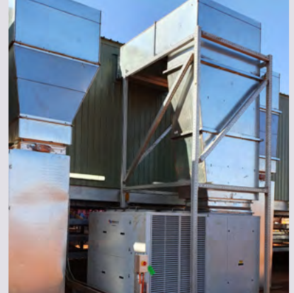
Mining Switchroom Duct Support