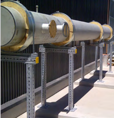
Whyalla Hospital Chiller Header Supports

This product simply screws together, eliminating the need of drilling, bolting and welding, effectively preventing on-site delays through its pregalvanised finish.