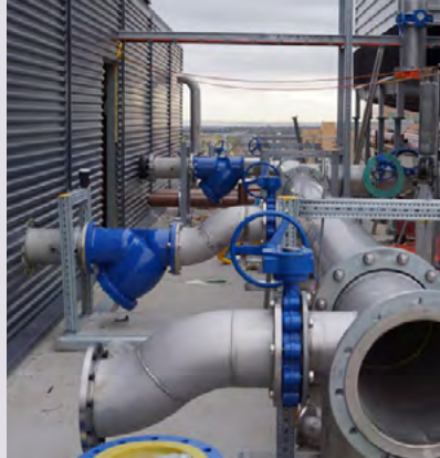
Tower 8 Rooftop Pipe Supports